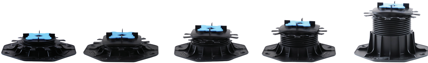
TSL-XS 26/36 mm TSL-S 36/43 mm TSL-M 43/60 mm TSL-L 58/75 mm TSL-XL 75/120 mm