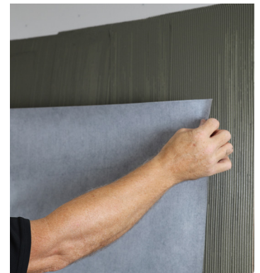
Method 3 (ARDEX TLT™ Waterproofing Membrane)