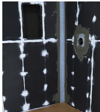
Method 2 (ARDEX TLT™ 700)