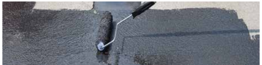
ARDEX MC™ Moisture Control Systems

FOR THE GENERAL CONTRACTOR – ACMS™ ensures floors will be as level as needed for the owner's application, minimizes schedule delays for the installation of flooring and removes floor levelness and moisture concerns from the equation.