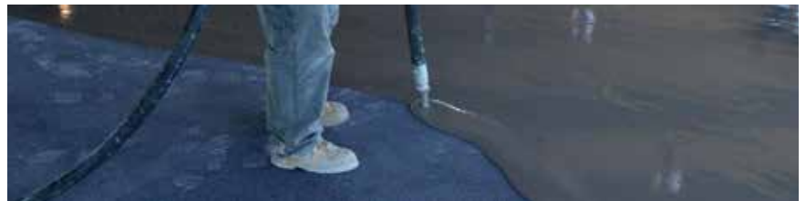
ARDEX HC 100™ High-Capacity Self-Leveling Underlayment ARDEX HC 100R™ High-Capacity Rapid Self-Leveling Underlayment

For detailed performance parameters and installation instructions, please refer to www.ardexacms.com . Formatted specifications are available from your ARDEX Representative.