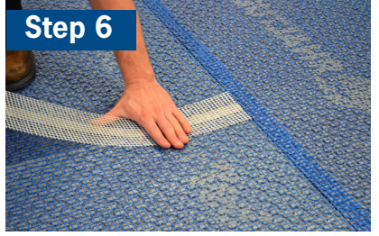
Use the self-adhesive ARDEX UD 158 Seam Reinforcement Mesh Strip to bond seams at the ends and cut areas of the membrane where there is no overlapping self-adhesive mesh.