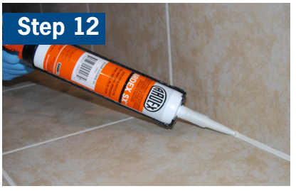
Fill movement and perimeter joints with an appropriate soft joint filler such as ARDEX CA 20 P or ARDEX SX.