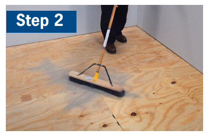
Sweep or vacuum debris from the substrate. In intermittent wet areas or where waterproofing is required, moisture-sensitive substrates, such as gypsum, must be protected from water damage by priming with ARDEX P 51 and installing ARDEX 8+9.