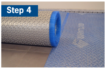
After cutting the membrane to size, unroll the ARDEX UI 720 FLEXBONE and loosely lay it over the substrate.