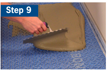
Using the flat side of a trowel, fill and smooth ARDEX UI 720 FLEXBONE with the appropriate ARDEX mortar so that the mortar is flush with the top of the mesh.