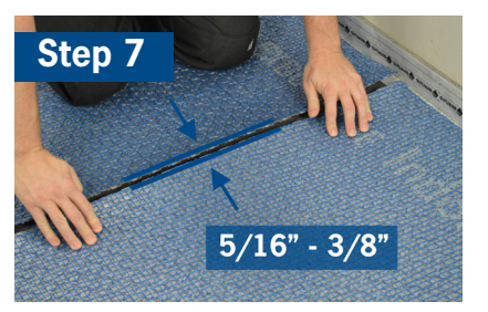
Leave a joint minimum width of 5/16" - 3/8" (8 - 10 mm) for expansion and field perimeter joints that sub-divide large areas, doorways, etc.