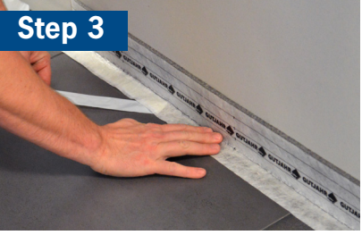
Along the perimeter walls and penetration of the covering, use ARDEX UD 146 Edge Insulation Strips with a self-sticking adhesive foot.