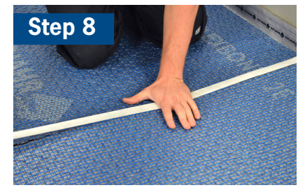
Cover the joints with self-adhesive ARDEX UD 156 Movement Joint Tape to protect against the entry of mortar and grout.