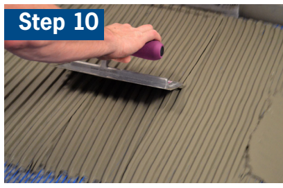
Use the appropriate notched trowel to comb the mortar, then install the tile or stone directly onto the membrane.