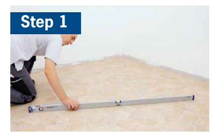
Check the substrate for load-bearing qualities, evenness and structural soundness. If leveling is necessary, a product such as ARDEX Liquid BackerBoard may be used.